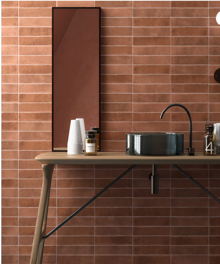
left pictured: sedona right pictured: storm