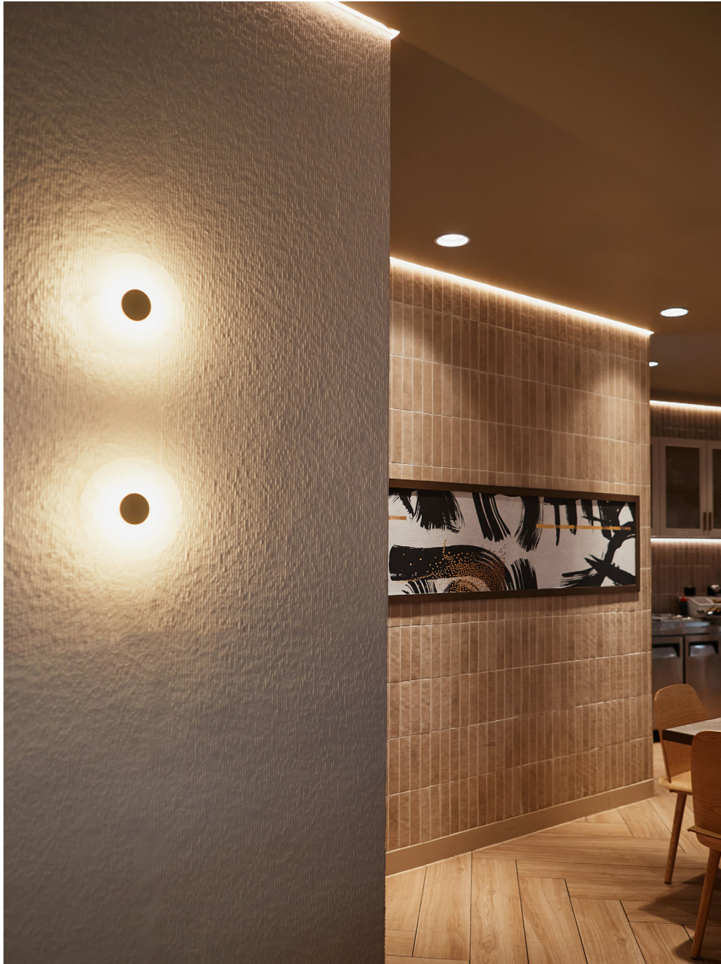
left pictured: dune right pictured: juniper